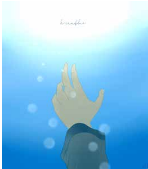
Digital art, Kit Harlan, Age 15.