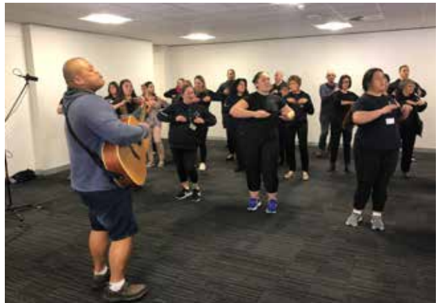
Te Kura Waiata group practising.