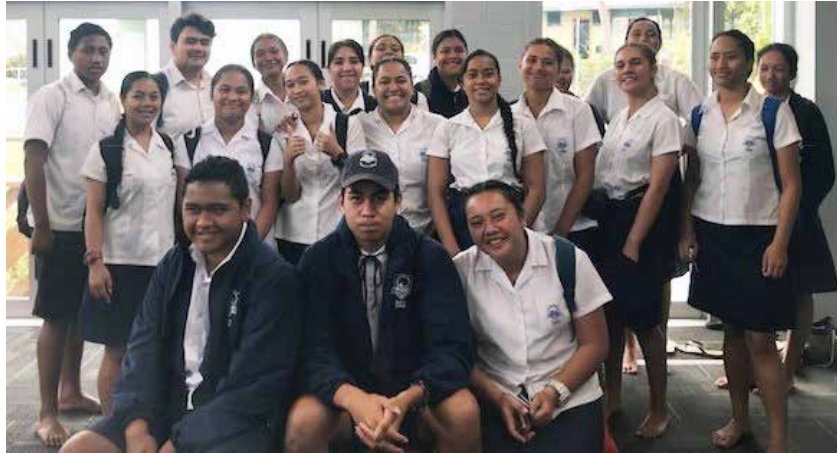
Some of the Year 11 Tereora students that studied Digital Technology through Te Kura.