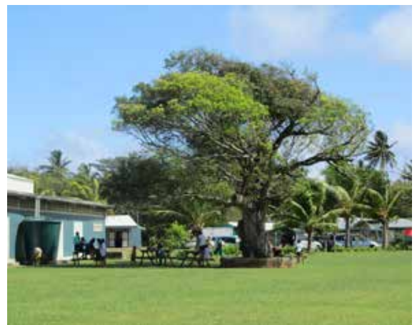
The grounds of Araura College located on Aitutaki. One of the challenges is the lack of air conditioning in the classrooms. The average temperature is 27 degrees.

“The trip helped enable us to identify where we can provide support. What we found was we needed to work hard on improving our relationships and communication between the students, supervisors and Te Kura staff”, says Wendy. “Now that we are more aware of the challenges involved, we are committed to finding ways to increase our engagement with our Cook Island students.”