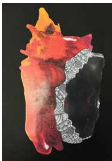
Wet and dry medium, Lathan Zahnd, Age 14.