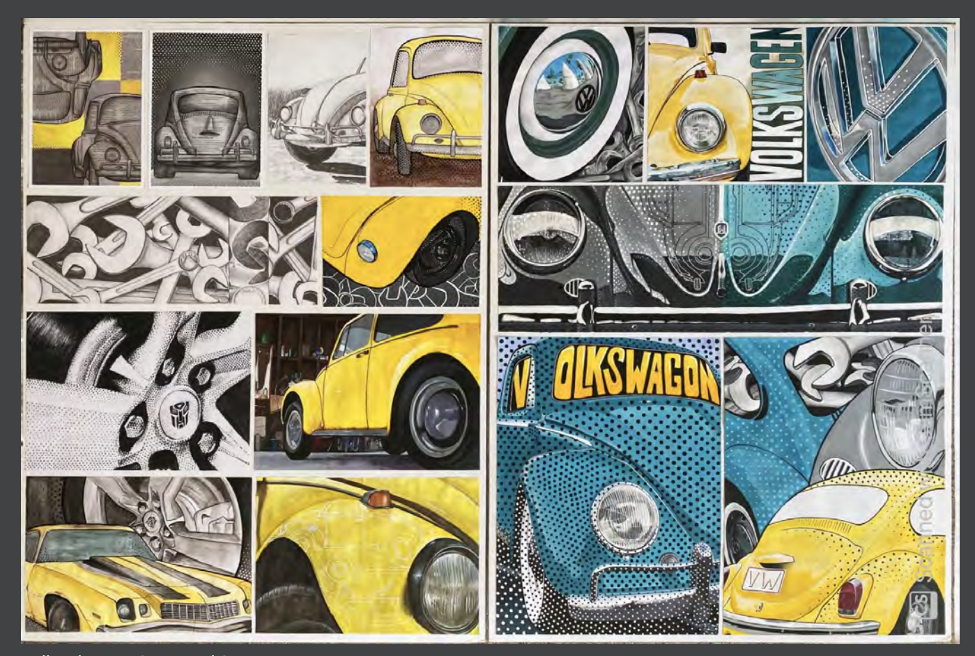
Bella Pilgrim NCEA Level 2