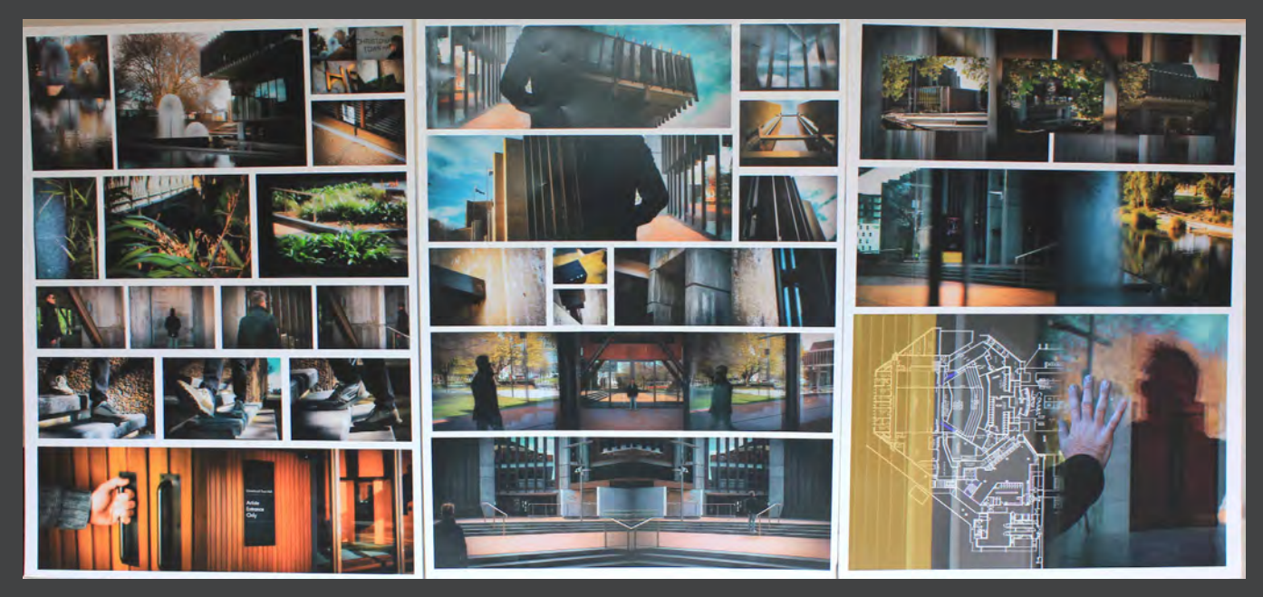
Mya Herrick NCEA Level 3