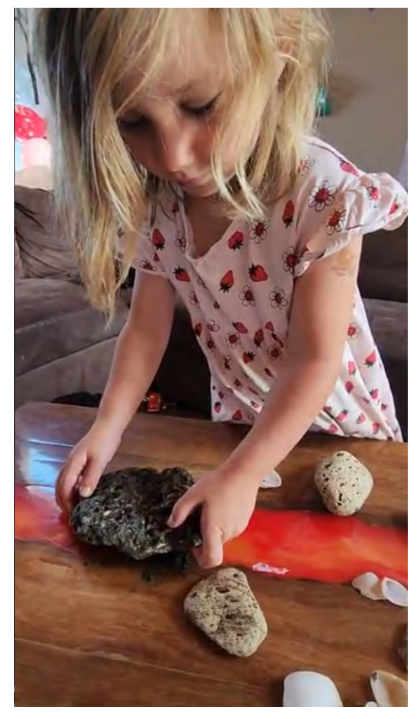
'I love going to the beach to find things because they are so cool. I have a collection of shells from different beaches. I have a rock with different fossils in it, and pumice which is so light.'