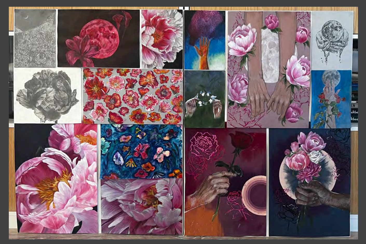
Brooke Hansen NCEA Level 1