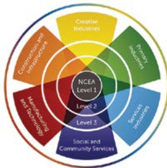
Vocational Pathways wheel diagram © New Zealand Ministry of Education. Used by permission.

Vocational Pathways awarded to an ākonga will show on their NZQA Record of Achievement.